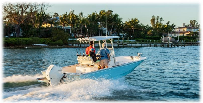
Not actual boat - Reference Only