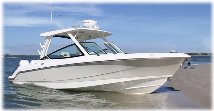
Not actual boat - Reference Only