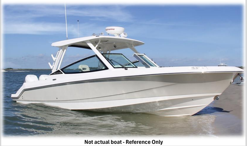
Not actual boat - Reference Only