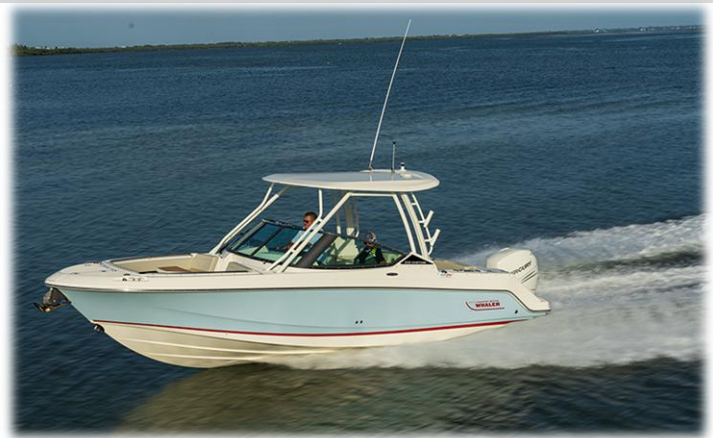
Not actual boat - Reference Only