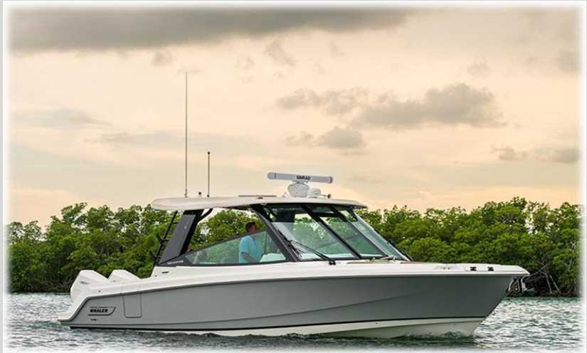
Not actual boat - Reference Only