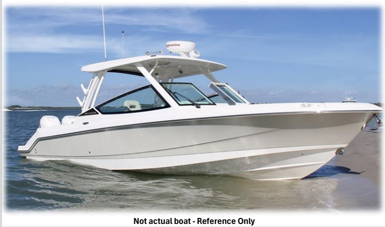
Not actual boat - Reference Only