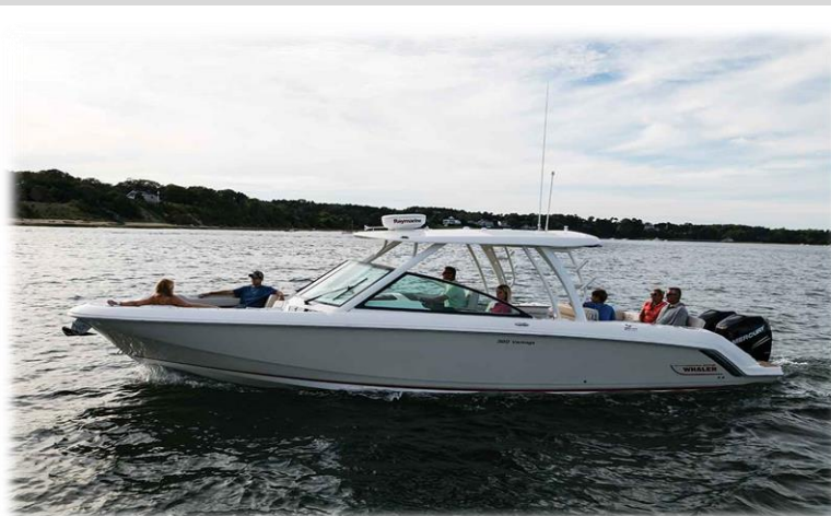
Not actual boat - Reference Only