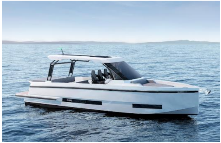
NON ACTUAL BOAT- REFERENCE ONLY