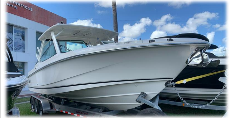
Not actual boat - Reference Only