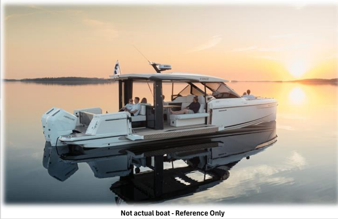
Not actual boat - Reference Only